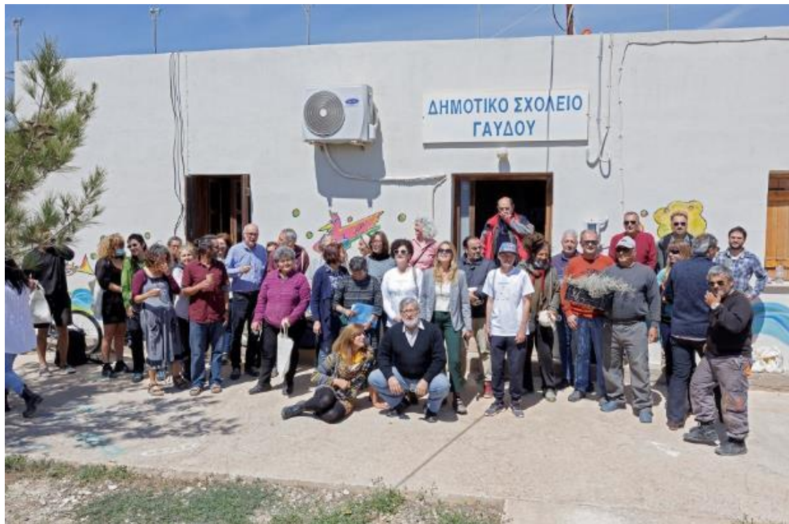
Photo 9. Group photo from dissemination event in Gavdos, 10 April 2022.