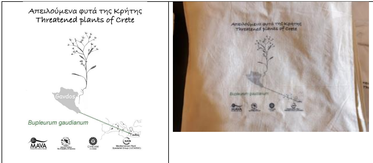
Figure 2. The design created for Bupleurum gaudianum by George Avgeros