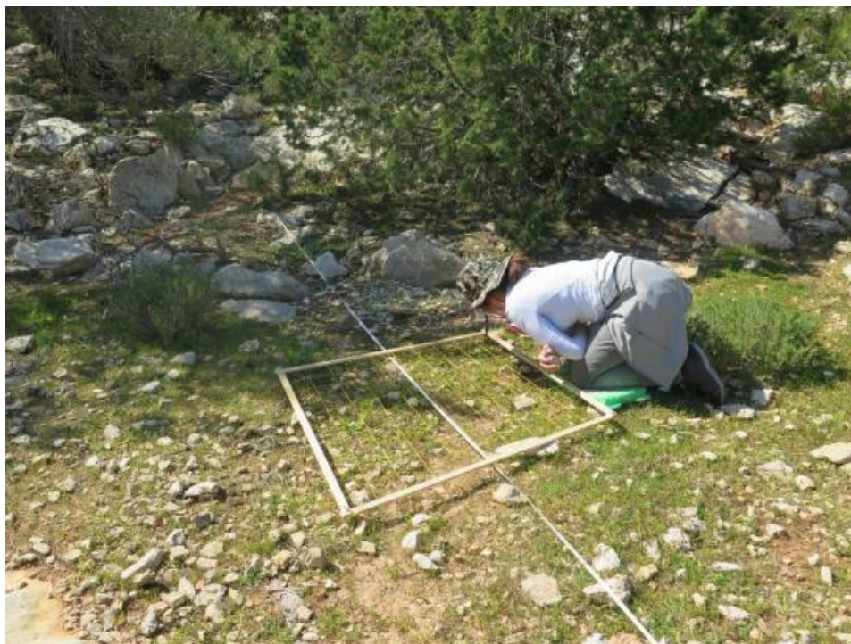
Photo 6. First recordings of Bupleurum gaudianum plants at the permanent monitoring plots established on 26 March 2022

In the context of management measures to address the threats, it is necessary to improve our knowledge on both the biology and ecology of the plant, to assess the trend of subpopulations and to record the threats they face. For this purpose, for long-term monitoring of the population of Bupleurum gaudianum 3 permanent plots (10 m 2 each) were established (Photo 6).