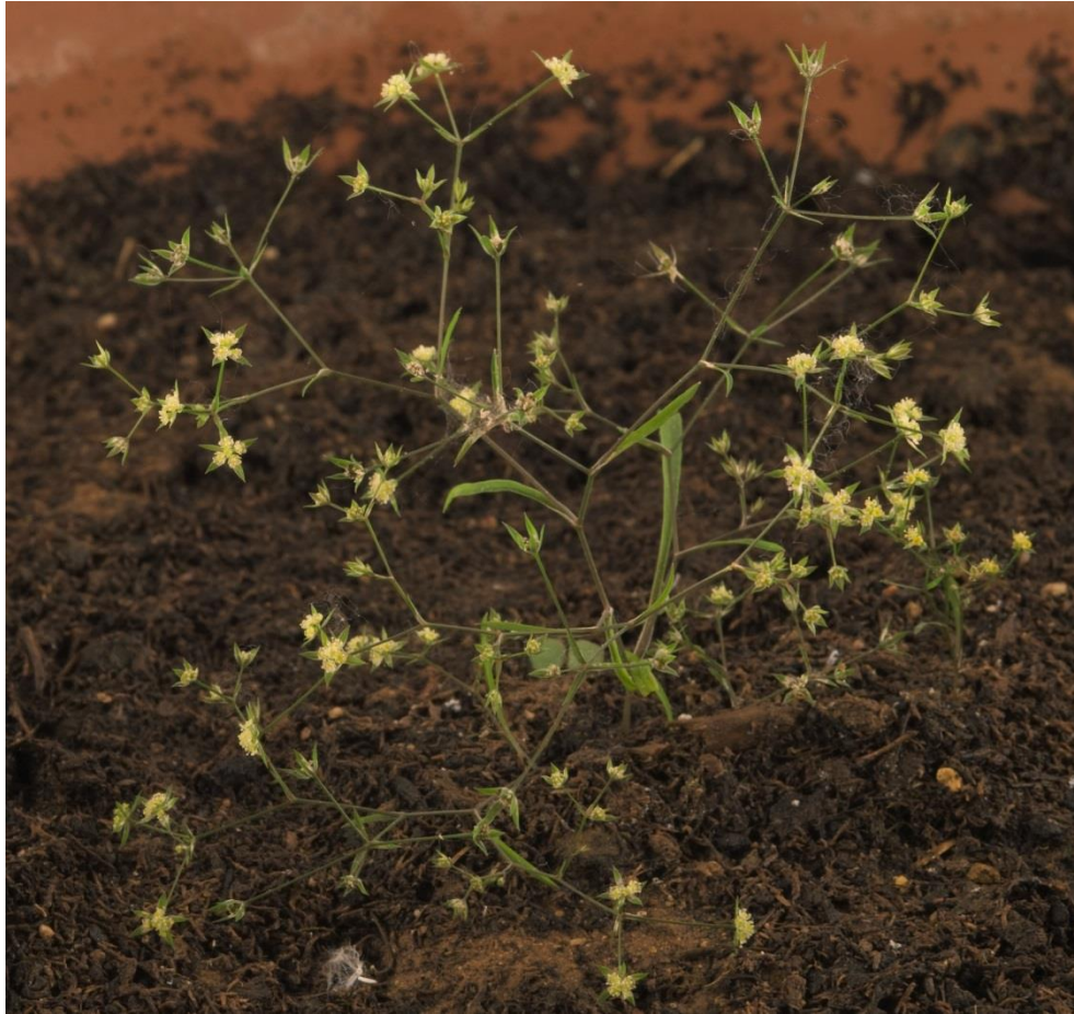
Photo 1. Bupleurum gaudianum plant in flowering

color of the petals is often drying white. Photographs taken during the flowering period do not confirm that the petal color is purplish; they are yellowish in contrast to B. semicompositum whose petal color is clearly purplish (Photo 4). We suggest that experts review this morphological feature of the species.