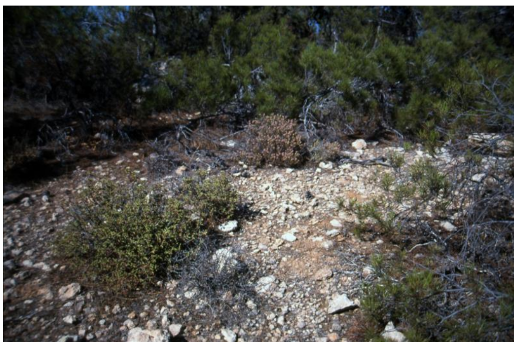
Photo 5. Habitat of Bupleurum gaudianum .

Habitat: Bupleurum gaudianum grows in low phrygana and open pinewoods on neogene sediments and sandstone, in openings between the dominating shrublets, among other short-lived, mostly early flowering annuals, altitude 0-300 m. The vegetation is, at least in most of its area, maintained by heavy grazing from domestic animals, mainly sheep and goats (Photo 5).