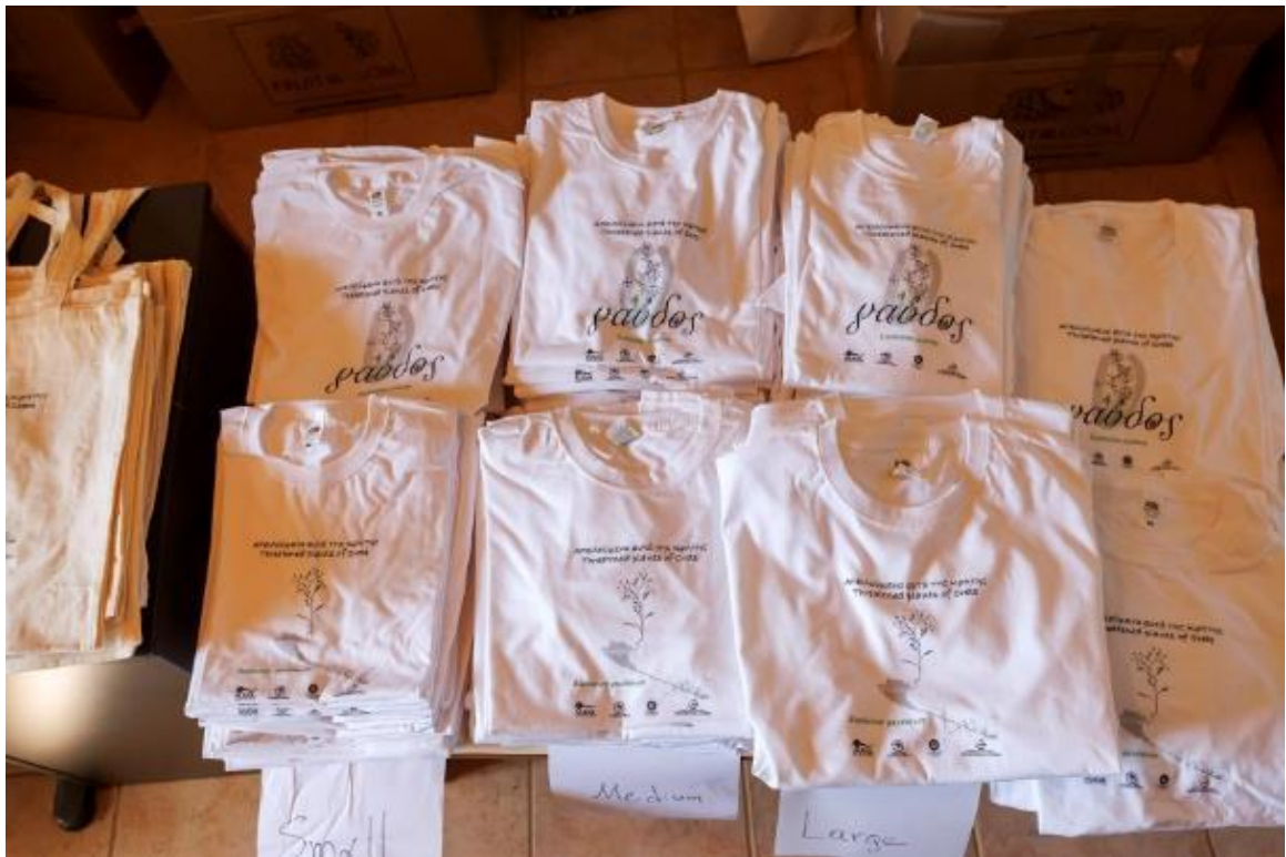
Photo 11. T-shirts of Callitriche pulchra and Bupleurum gaudianum .