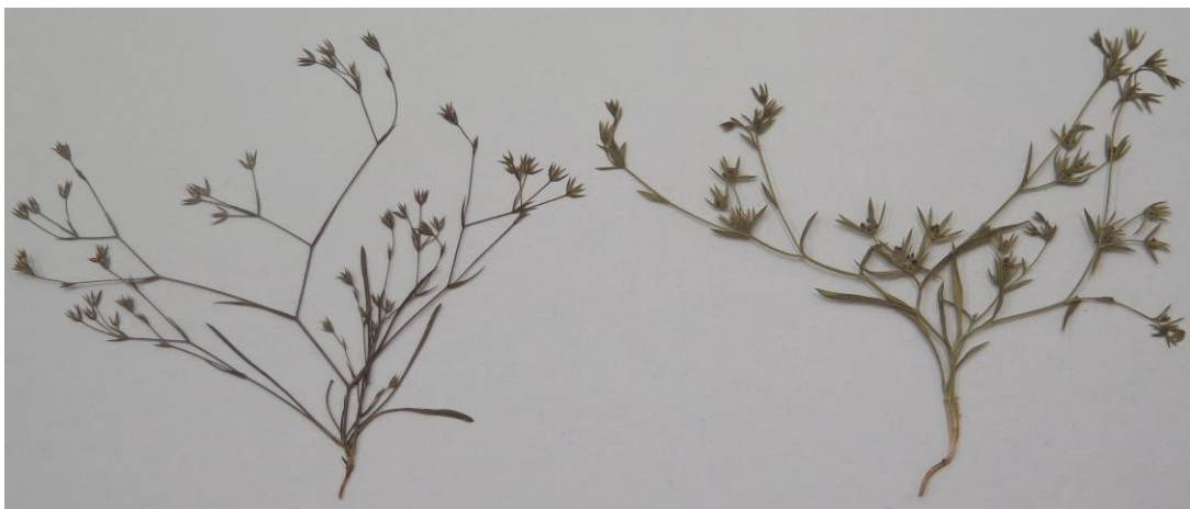
Photo 2. Dry specimens of Bupleurum gaudianum (left) and B. semicompositum (right) from the Herbarium of MAICH