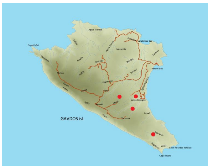
Map 1. Distribution of Bupleurum gaudianum on Gavdos island.

A detailed record of the plant on the island is needed since it coexists in many places with B. semicompositum and in many cases it is difficult to distinguish between them in the field. Locations recorded by simple observation in the field should be re-examined.