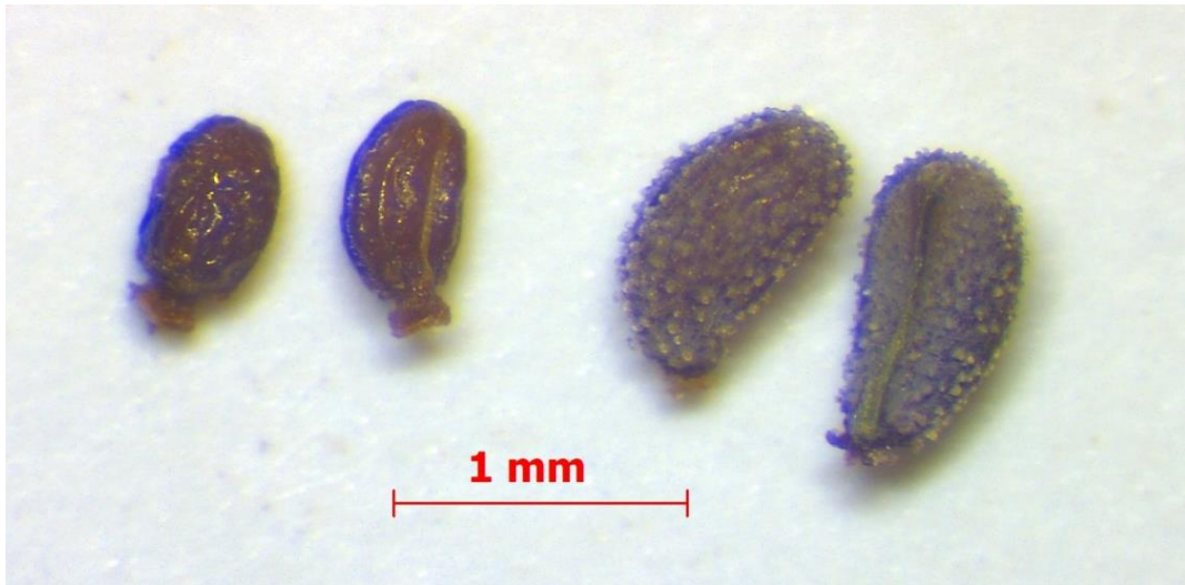
Photo 3. Fruits of Bupleurum gaudianum (left) and B. semicompositum (right)