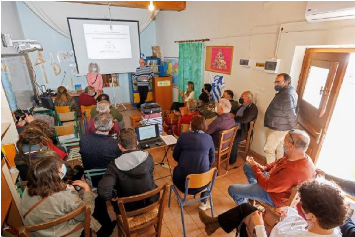
Photo 8. Dissemination event in Gavdos, 10 April 2022.