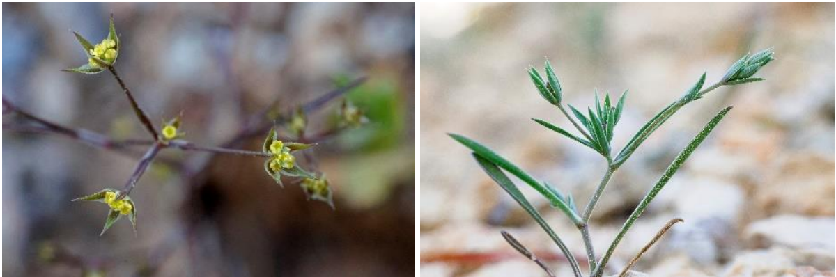
Photo 4. Plant of Bupleurum gaudianum (left) and B. semicompositum (right) in flowering.