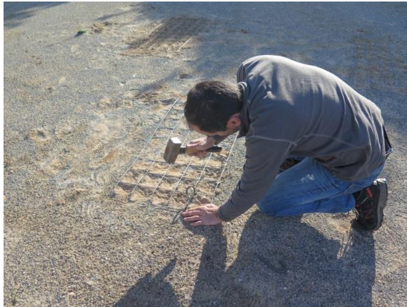
Photo 7. Example of a metal grid fixed to the ground

established near the grids (1 additional plot 10 m 2 for each grid), as described above for the permanent monitoring plots.